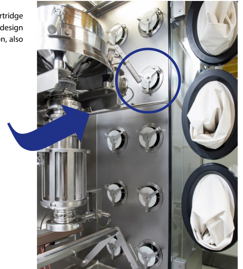
FIPA safe change filter cartridge